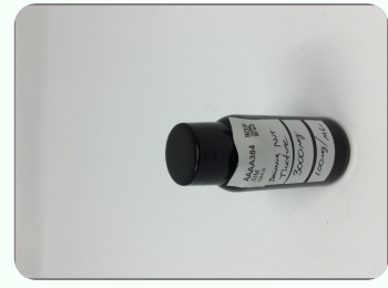
The photos on this report are of a sample collected by the lab and may vary from the final packaging.